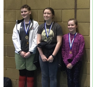
Girls U14 Medallists