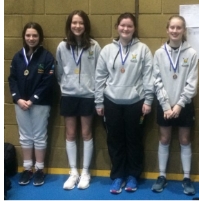
Girls U16 Medallists